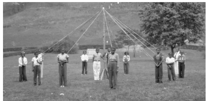
Roosevelt's C CC Project Photo 1936

defined in the concept of individual liberty, self-reliance and they are a moral people. The educational system that exists today excludes these concepts. It distorts our history and the meaning of words. It is no wonder that our youth emerge from the educational factories of socialism and communism as strangers. Political correctness originated in the Soviet Union. There is no room for political correctness in America.